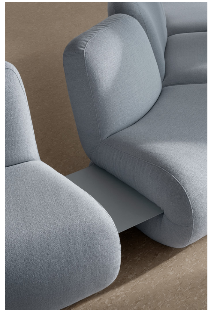
BAU Modular seating CIAO Table