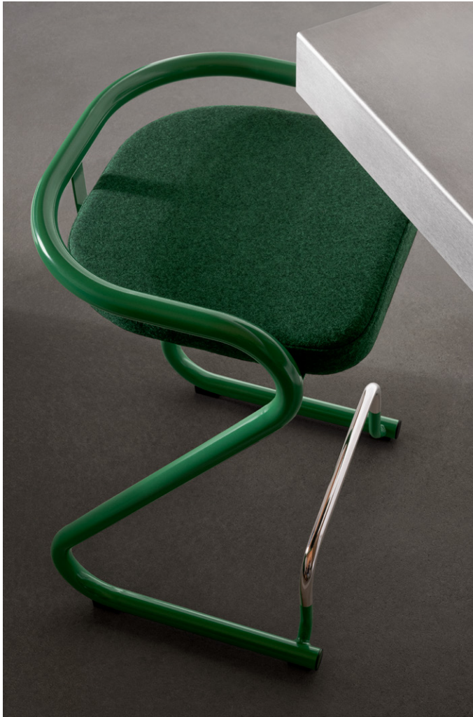
S70-3 Barstool S70-12 Coat hanger