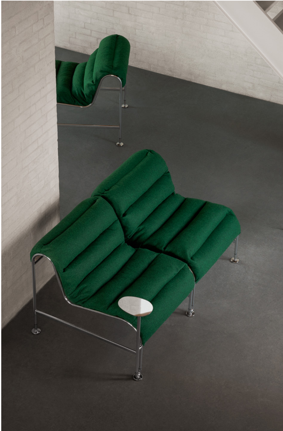
SUNNY Easy chair & modular seating