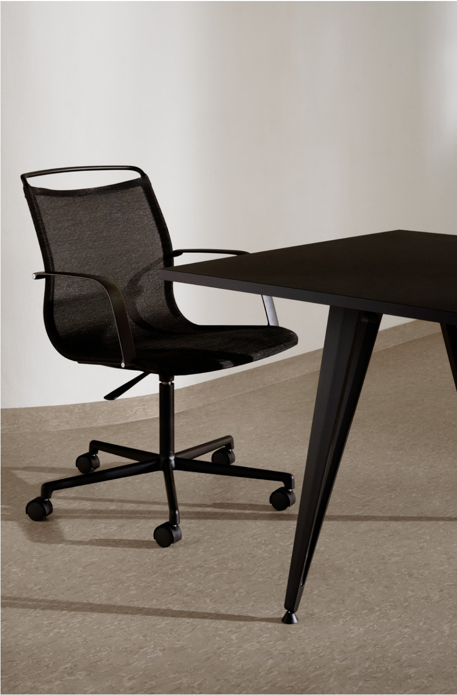
ATLAS AIR Armchair