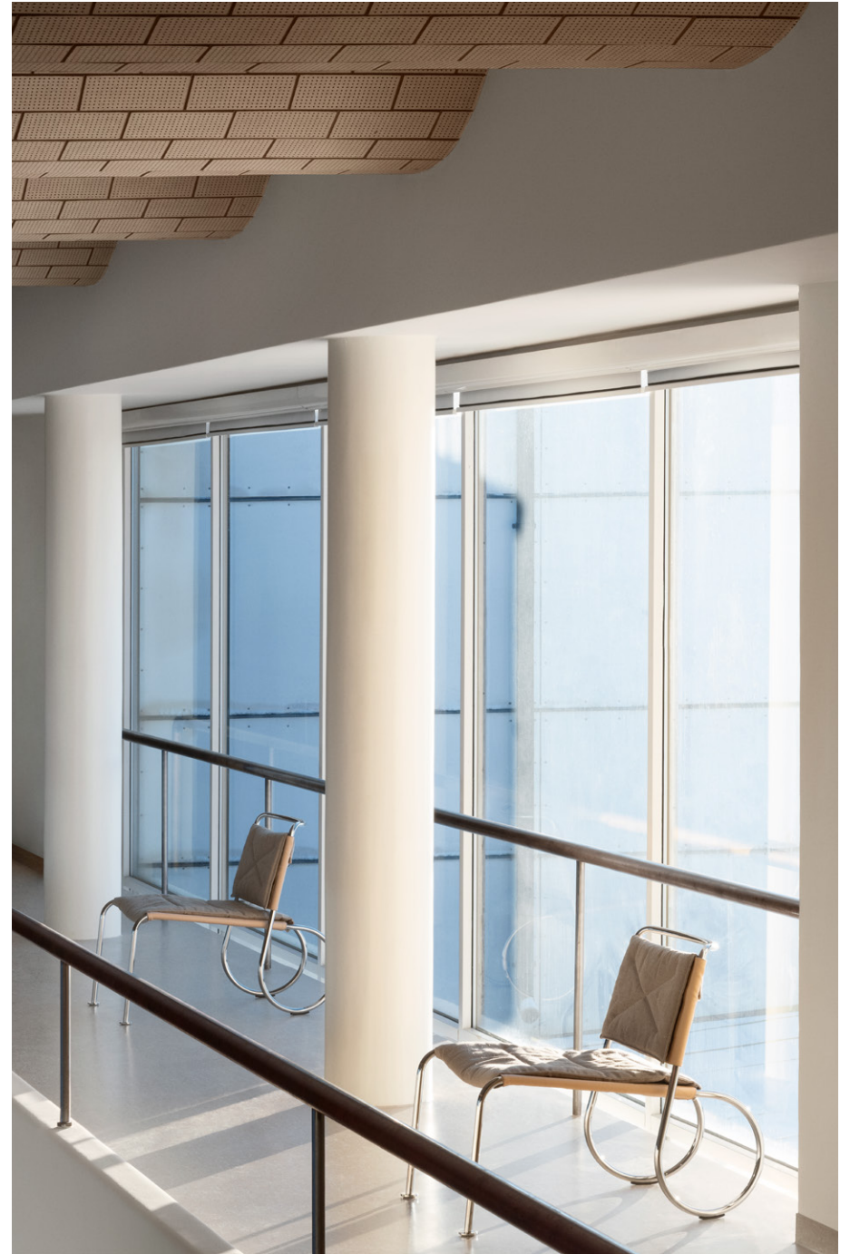
CORSO Easy chair