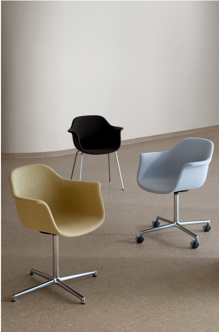
GRADE PLUS Armchair